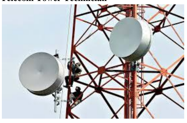
Telecom Tower Technician