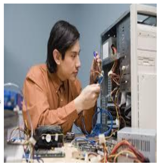
DTH Set Top Box Installation And Service Technician