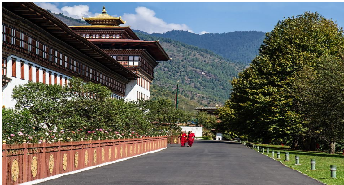
King's offices are here

Environmentally clean country, Bhutan does not allow polythene, nor do they generate any, besides there are no cultural polarization in terms of foreign films and songs, dances and dresses are not popular. People have to go to offices wearing their national dress and only on Saturdays they get to wear other clothes. Bhutanese are plain and simple as well as healthy people as they walk miles every day. Walking keeps them happy and healthy. The mountain air is fresh and pollution free.