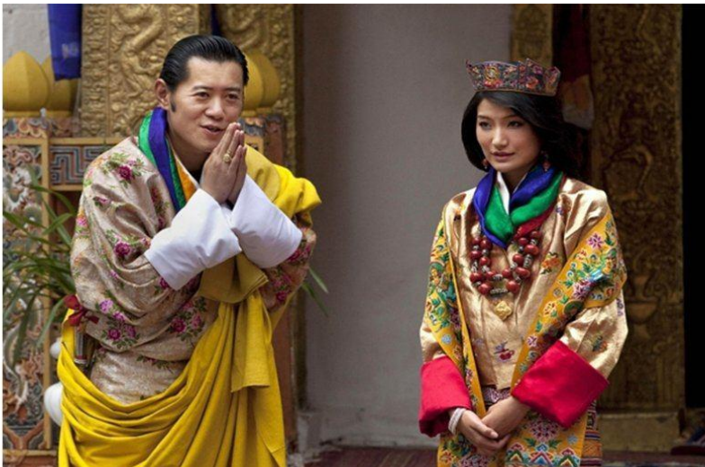
King & Queen of Bhutan