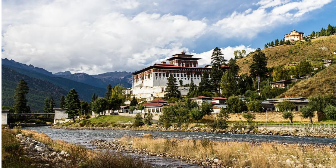
Paro river flowing through Thimphu the capital of Bhutan.