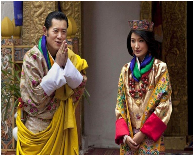
King and Queen of Bhutan