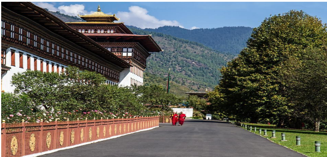
King's offices are here