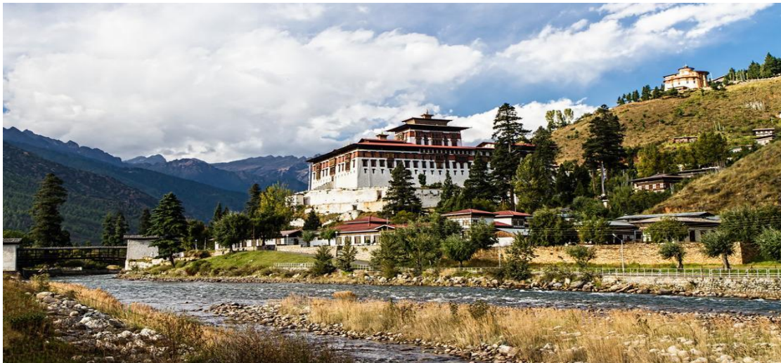
Paroriver flowing through Thimpu the capital of Bhutan.