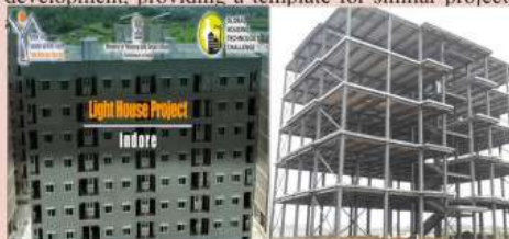
Fibre Reinforced Concrete (FRC)

By using modern construction methods and green technology, the PM Light House Project in Indore represents a shift towards faster, more sustainable urban development, providing a template for similar projects