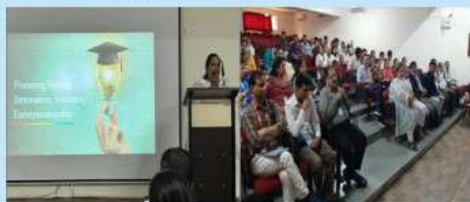
Induction Program Aarambh 2024