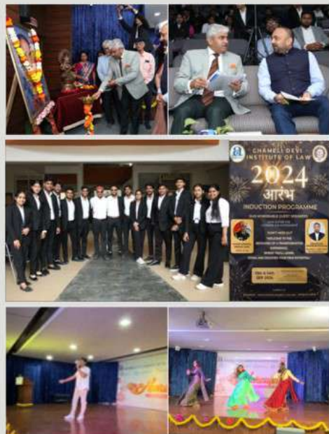
CDIL Induction Program "Aarambh" was organized on 13th & 14th September 2024.